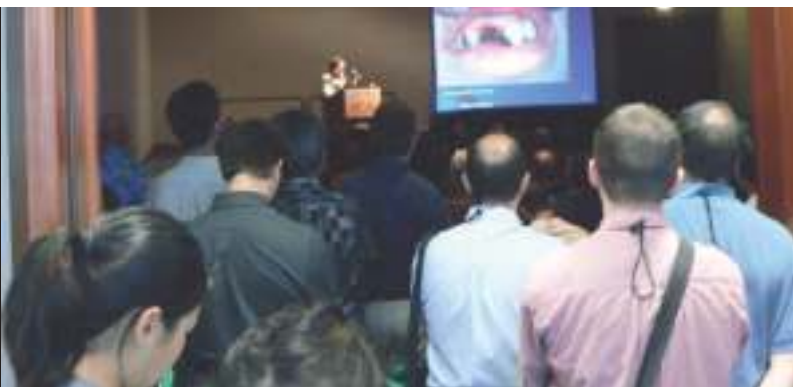
Attendees of a popular educational session at the 2006 Annual Session spill out into the hall of the Hawaii Convention Center.